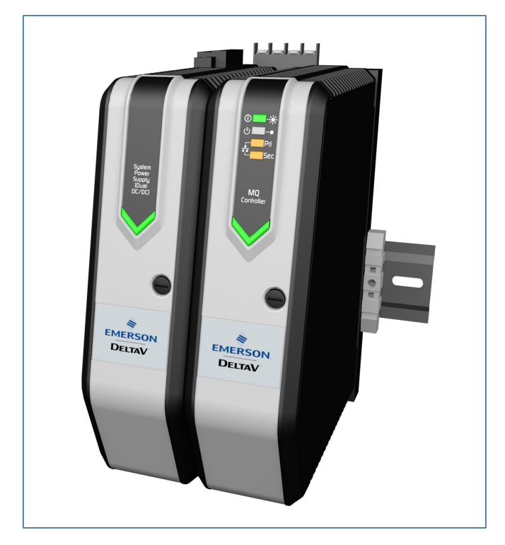
The MQ Controller.

Mounting. This plug-and-play system structure provides modular system growth with a single controller and can be mounted in a Class 1, Div 2 or ATEX Zone 2 environment. Refer to the System Power Supplies and I/O Subsystem Carriers product data sheets for additional information.