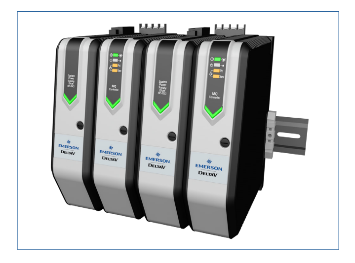
The DeltaV^{\mathbb{M}} MQ Controller and the DeltaV I/O subsystem make rapid installation easy.