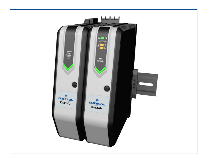
The MX Controller.

Cold restart. This feature provides automatic restart of the controller in case of a power failure. The restart is completely autonomous because the entire control strategy is stored in NVM RAM of the controller for this purpose. Simply set the restart state of the controller to current conditions.